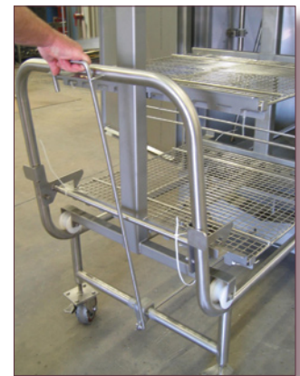
Cart docks and locks to cabinet rails. Rack is released to roll easily into washer.