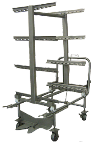
A versatile rack on rollers safely locks onto the transport cart.