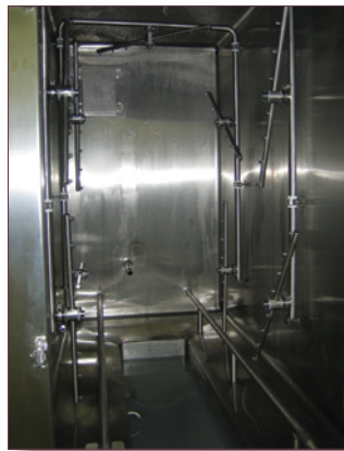
The rails accept the rack-on-rollers at the same level as the cart. No dangerous ramps or unsanitary pits.